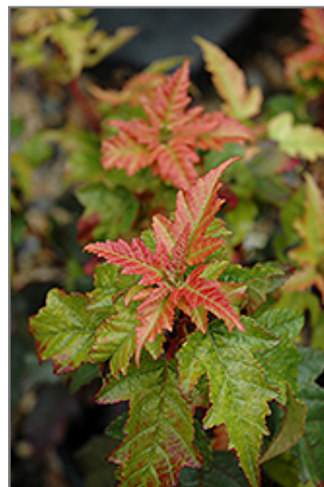
Atomic Amur Maple in fall