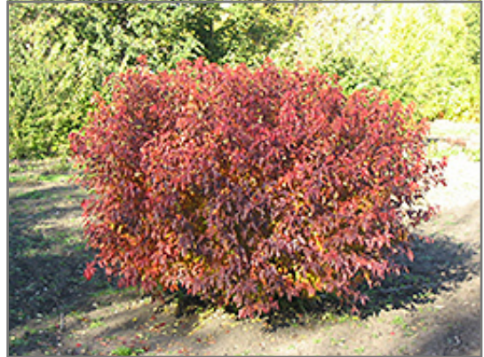
Atomic Amur Maple in fall

This shrub does best in full sun to partial shade. It is very adaptable to both dry and moist locations, and should do just fine under average home landscape conditions. It is not particular as to soil type or pH. It is highly tolerant of urban pollution and will even thrive in inner city environments. This is a selected variety of a species not originally from North America.