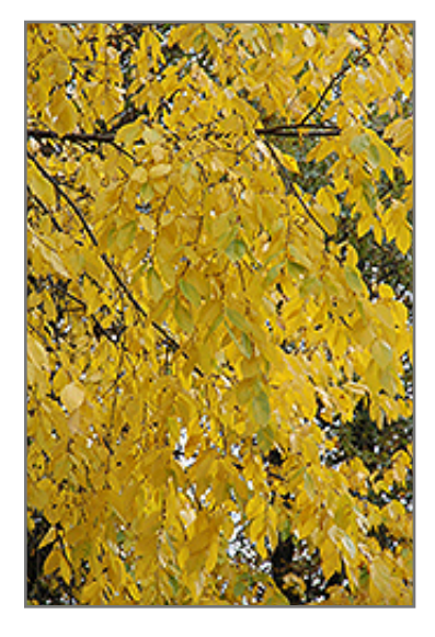
American Elm in fall

This tree should only be grown in full sunlight. It is an amazingly adaptable plant, tolerating both dry conditions and even some standing water. It is not particular as to soil type or pH, and is able to handle environmental salt. It is highly tolerant of urban pollution and will even thrive in inner city environments. This species is native to parts of North America.