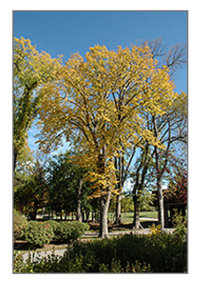
American Elm in fall

American Elm will grow to be about 80 feet tall at maturity, with a spread of 50 feet. It has a high canopy of foliage that sits well above the ground, and should not be planted underneath power lines. As it matures, the lower branches of this tree can be strategically removed to create a high enough canopy to support unobstructed human traffic underneath. It grows at a fast rate, and under ideal conditions can be expected to live to a ripe old age of 100 years or more; think of this as a heritage tree for future generations!