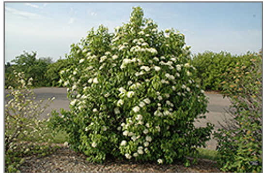
Nannyberry in bloom

Nannyberry is recommended for the following landscape applications;