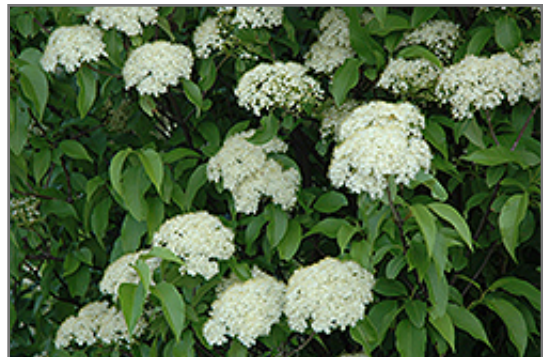
Nannyberry flowers