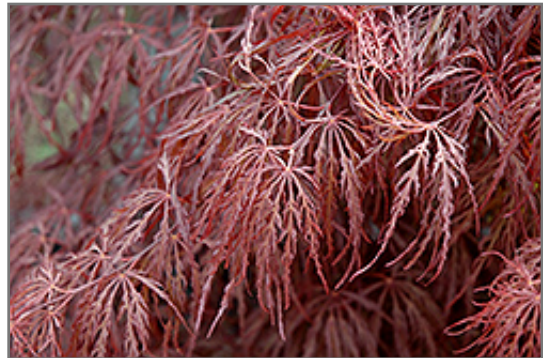
Crimson Queen Japanese Maple foliage