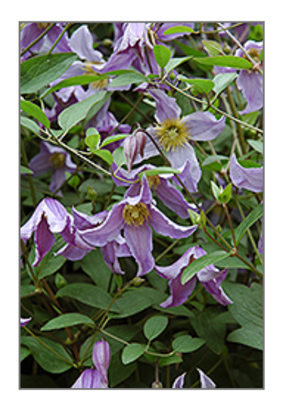
Blue Boy Clematis flowers

Blue Boy Clematis will grow to be about 10 feet tall at maturity, with a spread of 24 inches. As a climbing vine, it tends to be leggy near the base and should be underplanted with low-growing facer plants. It should be planted near a fence, trellis or other landscape structure where it can be trained to grow upwards on it, or allowed to trail off a retaining wall or slope. It grows at a medium rate, and under ideal conditions can be expected to live for approximately 20 years.