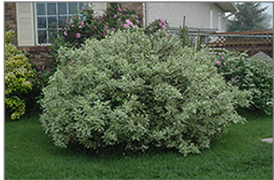
Ivory Halo Dogwood