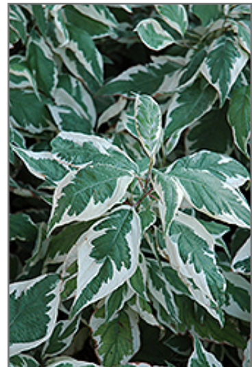
Ivory Halo Dogwood foliage