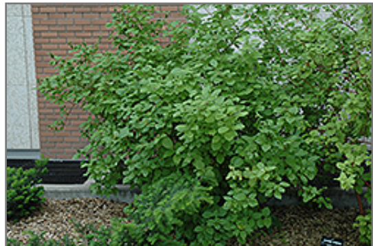
Siberian Dogwood