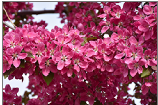
Big River Flowering Crab flowers