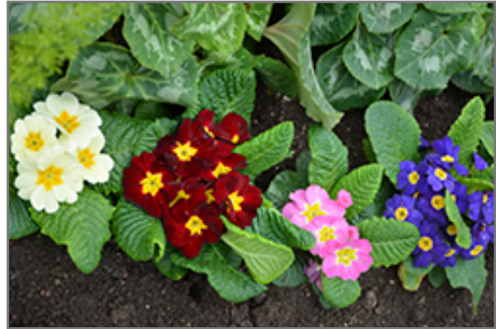
Primrose in bloom

Primrose will grow to be only 6 inches tall at maturity extending to 8 inches tall with the flowers, with a spread of 8 inches. When grown in masses or used as a bedding plant, individual plants should be spaced approximately 6 inches apart. Its foliage tends to remain low and dense right to the ground. It grows at a fast rate, and under ideal conditions can be expected to live for approximately 5 years. As an evergreen perennial, this plant will typically keep its form and foliage year-round.