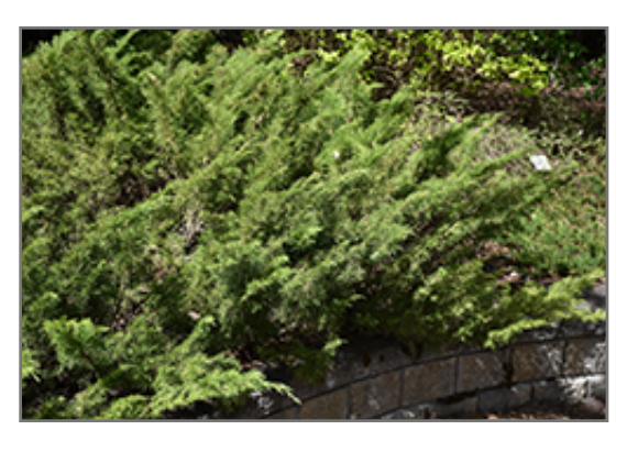
Skandia Juniper

Skandia Juniper is recommended for the following landscape applications;