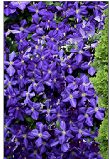
Jackmanii Clematis in bloom