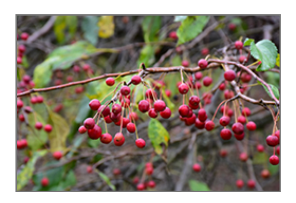
Red Jade Flowering Crab fruit