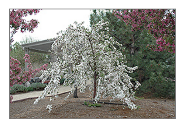
Red Jade Flowering Crab in bloom

Red Jade Flowering Crab is recommended for the following landscape applications;