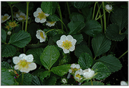
Seascape Strawberry flowers