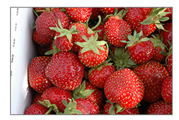
Seascape Strawberry fruit