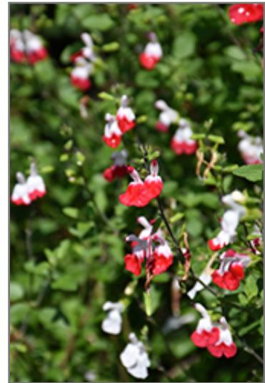
Hot Lips Sage flowers

Hot Lips Sage is a fine choice for the garden, but it is also a good selection for planting in outdoor pots and containers. With its upright habit of growth, it is best suited for use as a 'thriller' in the 'spiller-thriller-filler' container combination; plant it near the center of the pot, surrounded by smaller plants and those that spill over the edges. It is even sizeable enough that it can be grown alone in a suitable container. Note that when growing plants in outdoor containers and baskets, they may require more frequent waterings than they would in the yard or garden.