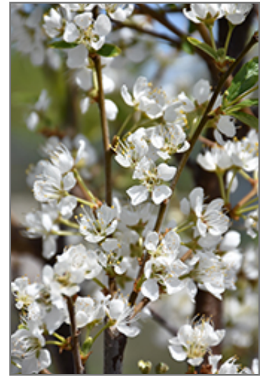
Toka Plum flowers