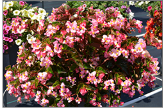
BabyWing Pink Begonia in bloom

BabyWing Pink Begonia will grow to be about 12 inches tall at maturity, with a spread of 12 inches. When grown in masses or used as a bedding plant, individual plants should be spaced approximately 10 inches apart. Its foliage tends to remain dense right to the ground, not requiring facer plants in front. Although it's not a true annual, this plant can be expected to behave as an annual in our climate if left outdoors over the winter, usually needing replacement the following year. As such, gardeners should take into consideration that it will perform differently than it would in its native habitat.