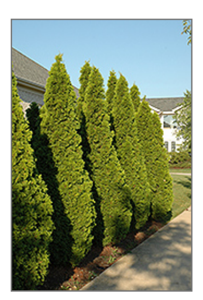
Emerald Green Arborvitae