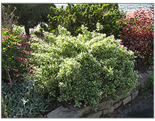
Emerald Gaiety Wintercreeper