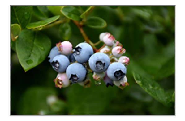
Elliott Blueberry fruit

Elliott Blueberry features dainty clusters of white bell-shaped flowers with shell pink overtones hanging below the branches in mid spring. It has green deciduous foliage. The glossy oval leaves turn yellow in fall. It features an abundance of magnificent blue berries from late summer to early fall. The smooth brick red bark adds an interesting dimension to the landscape.