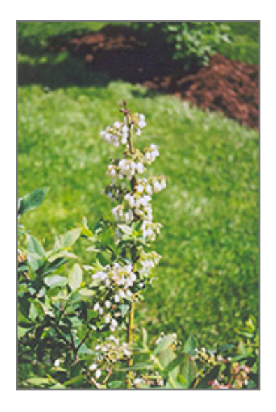
Elliott Blueberry flowers

Elliott Blueberry will grow to be about 6 feet tall at maturity, with a spread of 5 feet. It tends to be a little leggy, with a typical clearance of 1 foot from the ground, and is suitable for planting under power lines. It grows at a medium rate, and under ideal conditions can be expected to live for approximately 30 years. This variety requires a different selection of the same species growing nearby in order to set fruit.