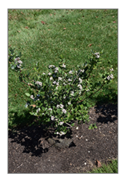
Elliott Blueberry fruit

1818 Central Avenue Saskatoon, SK S7N 2Z9 (306) 249-1222 www.dutchgrowers.com