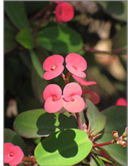
Crown Of Thorns flowers

Crown Of Thorns is recommended for the following landscape applications;