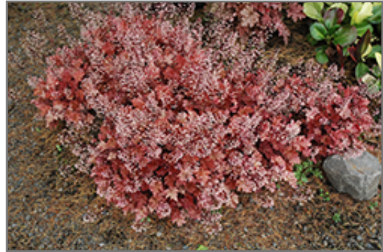
Peach Crisp Coral Bells in bloom

Peach Crisp Coral Bells is recommended for the following landscape applications;