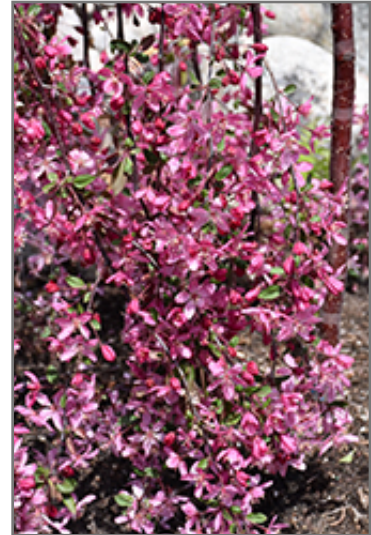
Royal Beauty Flowering Crab flowers