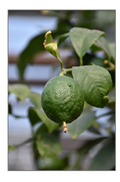
Persian Lime fruit

Persian Lime features showy clusters of fragrant white star-shaped flowers with yellow eyes at the ends of the branches from late winter to early spring. It has attractive dark green evergreen foliage. The glossy oval leaves are highly ornamental and remain dark green throughout the winter. It features an abundance of magnificent green berries in mid summer.