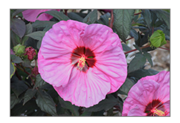
Summerific Berry Awesome Hibiscus flowers

Summerific Berry Awesome Hibiscus is recommended for the following landscape applications;