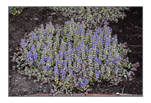
Burgundy Glow Bugleweed in bloom

Gardener's Challenge Plant Regular Warranty Does Not Apply