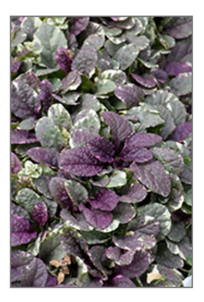
Burgundy Glow Bugleweed foliage