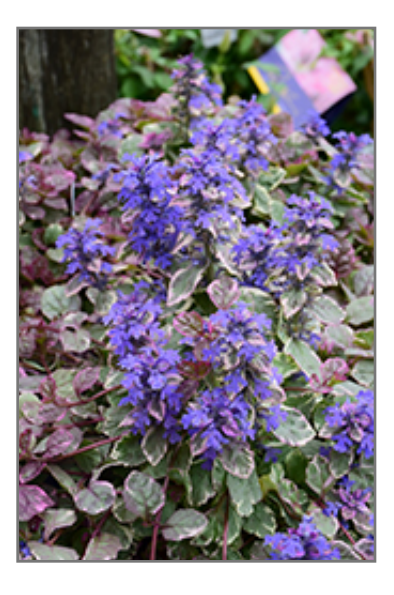
Burgundy Glow Bugleweed flowers

Burgundy Glow Bugleweed is a dense herbaceous evergreen perennial with a ground-hugging habit of growth. Its medium texture blends into the garden, but can always be balanced by a couple of finer or coarser plants for an effective composition.