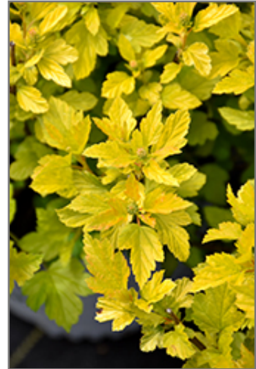
Tiny Wine Gold Ninebark foliage

Tiny Wine Gold Ninebark is recommended for the following landscape applications;