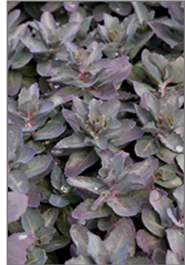
Cherry Truffle Stonecrop foliage

Cherry Truffle Stonecrop is a fine choice for the garden, but it is also a good selection for planting in outdoor pots and containers. It is often used as a 'filler' in the 'spiller-thriller-filler' container combination, providing a mass of flowers and foliage against which the larger thriller plants stand out. Note that when growing plants in outdoor containers and baskets, they may require more frequent waterings than they would in the yard or garden. Be aware that in our climate, most plants cannot be expected to survive the winter if left in containers outdoors, and this plant is no exception. Contact our experts for more information on how to protect it over the winter months.