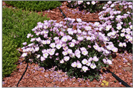
Twilight Evening Primrose in bloom