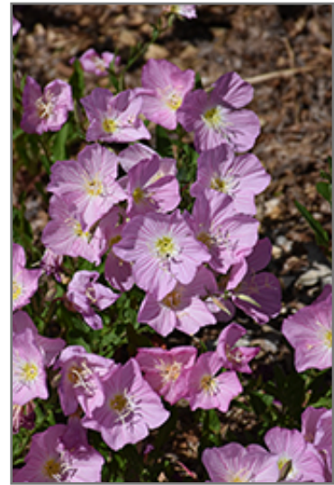
Twilight Evening Primrose flowers