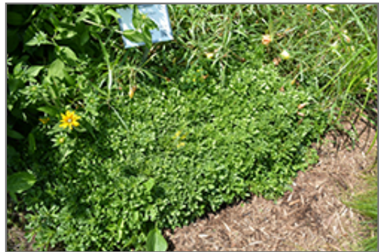
Czar's Gold Stonecrop