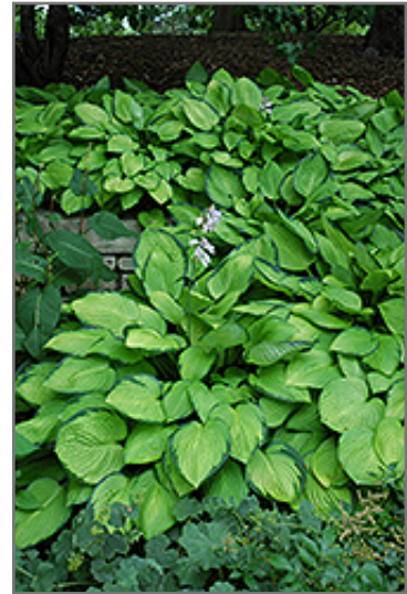
Gold Standard Hosta in bloom