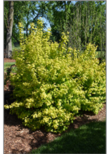
Oh Canada Cranberry Bush

This shrub does best in full sun to partial shade. It prefers to grow in average to moist conditions, and shouldn't be allowed to dry out. It is not particular as to soil type or pH. It is highly tolerant of urban pollution and will even thrive in inner city environments. This is a selected variety of a species not originally from North America.