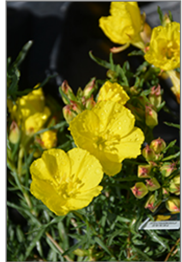
Yellow Sundrops flowers

Gardener's Challenge Plant Regular Warranty Does Not Apply