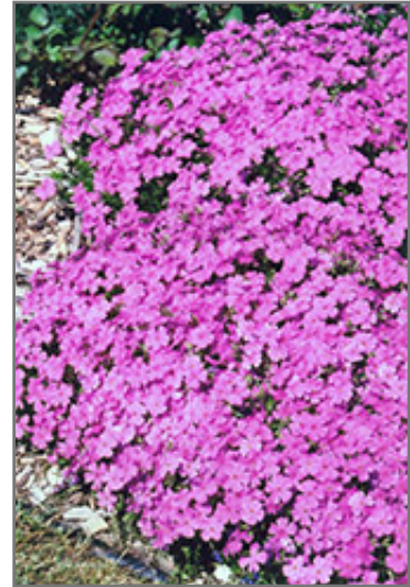
Arctic Phlox flowers