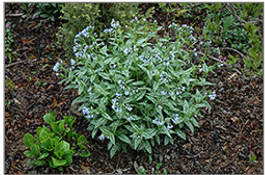
Roy Davidson Lungwort in bloom