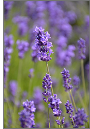
Imperial Gem Lavender flowers

Imperial Gem Lavender is recommended for the following landscape applications;