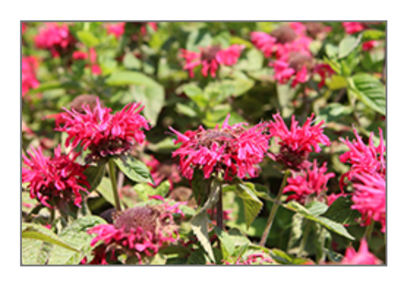
Bee-You Bee-Happy Beebalm flowers

Bee-You Bee-Happy Beebalm has masses of beautiful clusters of fragrant red pincushion flowers with hot pink overtones and dark brown eyes at the ends of the stems from mid summer to early fall, which are most effective when planted in groupings. The flowers are excellent for cutting. Its fragrant pointy leaves remain dark green in colour throughout the season.