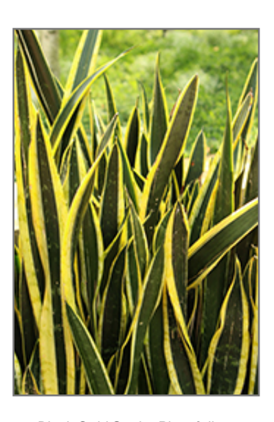
Black Gold Snake Plant foliage

When grown indoors, Black Gold Snake Plant can be expected to grow to be about 3 feet tall at maturity, with a spread of 12 inches. It grows at a slow rate, and under ideal conditions can be expected to live for approximately 10 years. This houseplant performs well in both bright or indirect sunlight and strong artificial light, and can therefore be situated in almost any well-lit room or location. It is very adaptable to both dry and moist soil, but will not tolerate any standing water. The surface of the soil shouldn't be allowed to dry out completely, and so you should expect to water this plant once and possibly even twice each week. Be aware that your particular watering schedule may vary depending on its location in the room, the pot size, plant size and other conditions; if in doubt, ask one of our experts in the store for advice. It will benefit from a regular feeding with a general-purpose fertilizer with every second or third watering. It is not particular as to soil pH, but grows best in sandy soil. Contact the store for specific recommendations on pre-mixed potting soil for this plant.