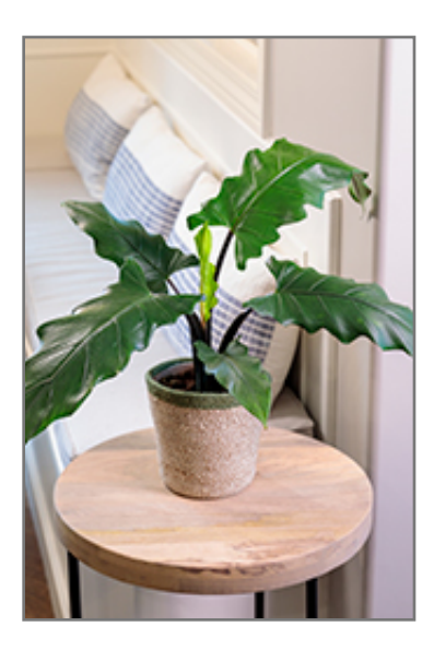
Mythic Lauterbachiana Purple Sword Elephant Ears in full