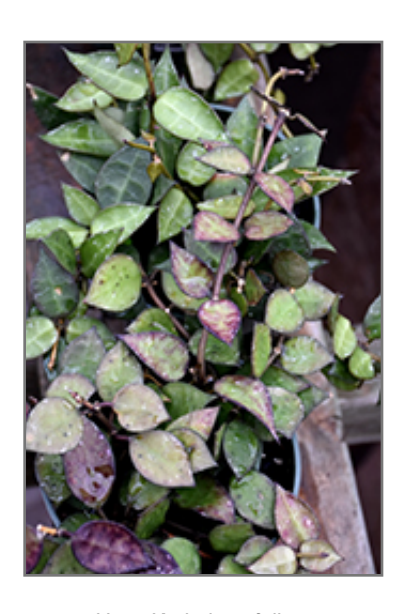
Hoya Krohniana foliage

When grown indoors, Hoya Krohniana can be expected to grow to be about 6 feet tall at maturity, with a spread of 24 inches. It grows at a medium rate, and under ideal conditions can be expected to live for approximately 10 years. This houseplant should be situated in a location that that gets indirect sunlight at most, although it will usually require a more brightly-lit environment than what artificial indoor lighting alone can provide. It is very adaptable to both dry and moist soil, but will not tolerate any standing water. The surface of the soil shouldn't be allowed to dry out completely, and so you should expect to water this plant once and possibly even twice each week. Be aware that your particular watering schedule may vary depending on its location in the room, the pot size, plant size and other conditions; if in doubt, ask one of our experts in the store for advice. It is not particular as to soil pH, but grows best in rich soil. Contact the store for specific recommendations on pre-mixed potting soil for this plant.