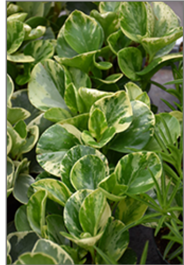
Golden Gate Baby Rubber Plant foliage

This is an herbaceous evergreen houseplant with an upright spreading habit of growth. This plant should not require much pruning, except when necessary to keep it looking its best.