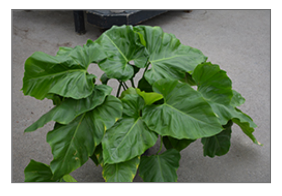
Giant Philodendron in full