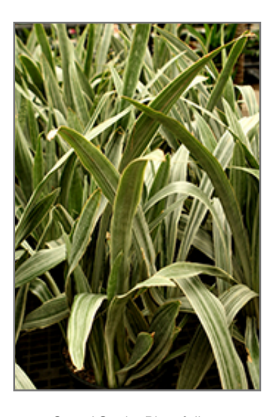
Sayuri Snake Plant foliage

When grown indoors, Sayuri Snake Plant can be expected to grow to be about 3 feet tall at maturity, with a spread of 18 inches. It grows at a slow rate, and under ideal conditions can be expected to live for approximately 10 years. This houseplant performs well in both bright or indirect sunlight and strong artificial light, and can therefore be situated in almost any well-lit room or location. It is very adaptable to both dry and moist soil, and should do just fine under average home conditions. The surface of the soil shouldn't be allowed to dry out completely, and so you should expect to water this plant once and possibly even twice each week. Be aware that your particular watering schedule may vary depending on its location in the room, the pot size, plant size and other conditions; if in doubt, ask one of our experts in the store for advice. It will benefit from a regular feeding with a general-purpose fertilizer with every second or third watering. It is not particular as to soil pH, but grows best in sandy soil. Contact the store for specific recommendations on pre-mixed potting soil for this plant.