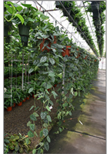
Argyraeus Pothos in full

There are many factors that will affect the ultimate height, spread and overall performance of a plant when grown indoors; among them, the size of the pot it's growing in, the amount of light it receives, watering frequency, the pruning regimen and repotting schedule. Use the information described here as a guideline only; individual performance can and will vary. Please contact the store to speak with one of our experts if you are interested in further details concerning recommendations on pot size, watering, pruning, repotting, etc.