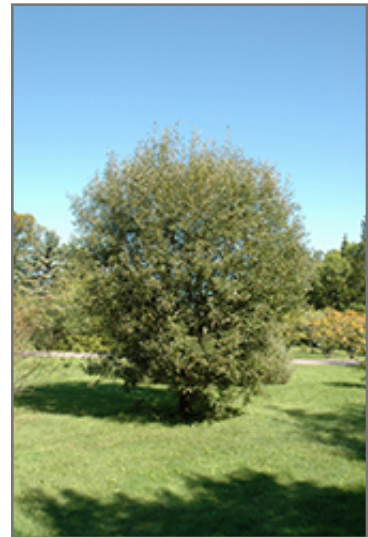
Pussy Willow