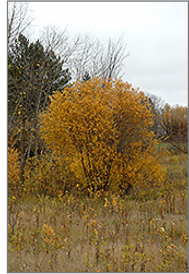
Pussy Willow in fall

This shrub does best in full sun to partial shade. It is quite adaptable, preferring to grow in average to wet conditions, and will even tolerate some standing water. It is not particular as to soil type or pH. It is somewhat tolerant of urban pollution. This species is native to parts of North America.