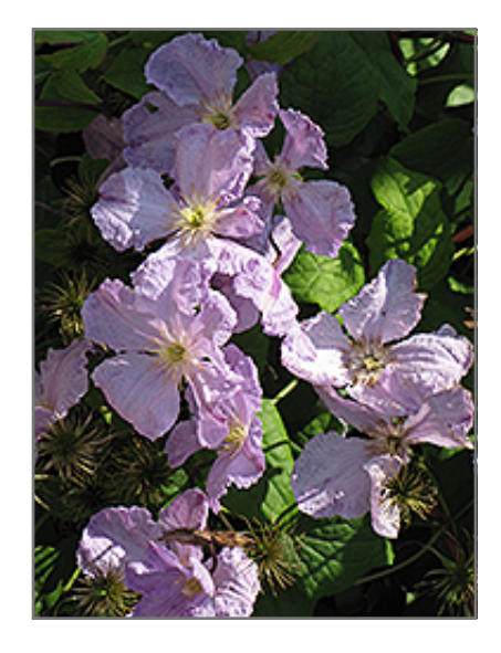
Blue Angel Clematis flowers