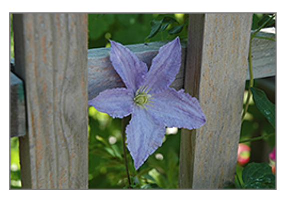
Blue Angel Clematis flowers

1818 Central Avenue Saskatoon, SK S7N 2Z9 (306) 249-1222 www.dutchgrowers.com