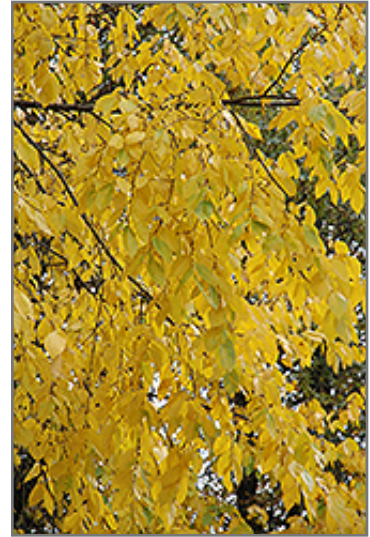
American Elm in fall

This tree should only be grown in full sunlight. It is an amazingly adaptable plant, tolerating both dry conditions and even some standing water. It is not particular as to soil type or pH, and is able to handle environmental salt. It is highly tolerant of urban pollution and will even thrive in inner city environments. This species is native to parts of North America.