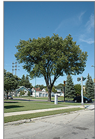
American Elm