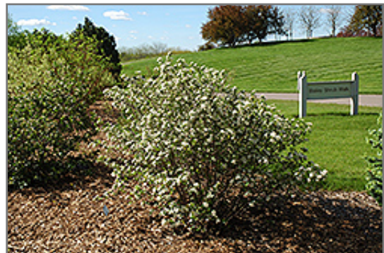
Autumn Magic Black Chokeberry in bloom