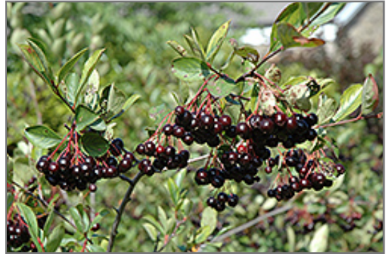
Autumn Magic Black Chokeberry fruit

This shrub should only be grown in full sunlight. It is an amazingly adaptable plant, tolerating both dry conditions and even some standing water. It is not particular as to soil type or pH, and is able to handle environmental salt. It is somewhat tolerant of urban pollution. This is a selection of a native North American species.