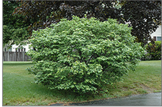
Dwarf Winged Burning Bush

This shrub performs well in both full sun and full shade. It is very adaptable to both dry and moist locations, and should do just fine under average home landscape conditions. It is not particular as to soil type or pH. It is highly tolerant of urban pollution and will even thrive in inner city environments. This is a selected variety of a species not originally from North America.