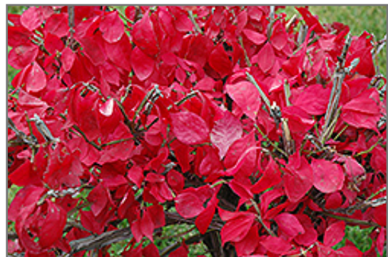
Dwarf Winged Burning Bush in fall