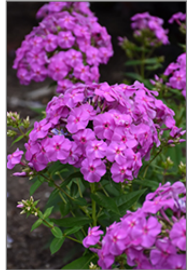
Flame Lilac Garden Phlox flowers

Flame Lilac Garden Phlox is recommended for the following landscape applications;