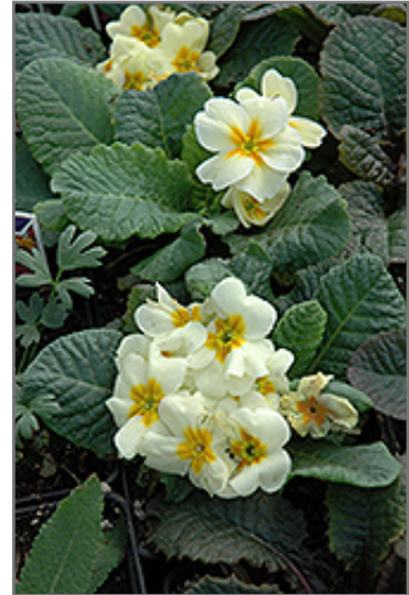
Wanda Primrose flowers

Wanda Primrose is recommended for the following landscape applications;